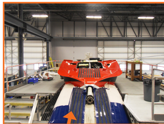
BASELINE INSTALLATION SIMULATIONS: ENGINE VIEW (TOP), RAMP VIEW (BOTTOM)