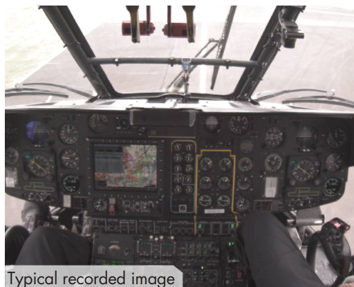
Typical recorded image

To always keep you safe and mission-ready while reducing cost of ownership